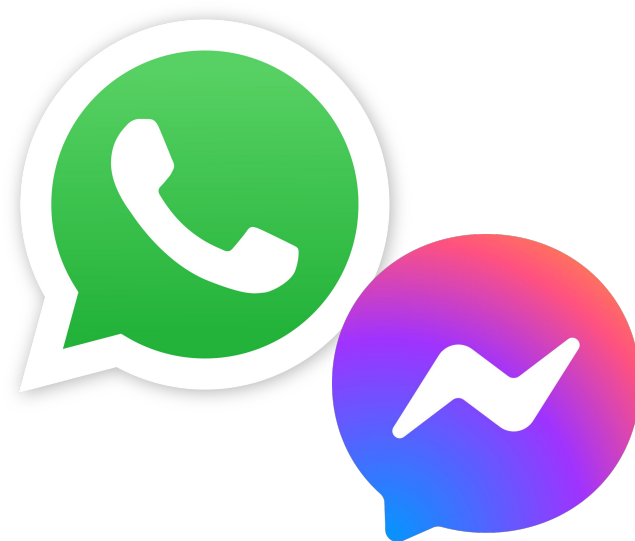
WhatsApp Facebook Messenger